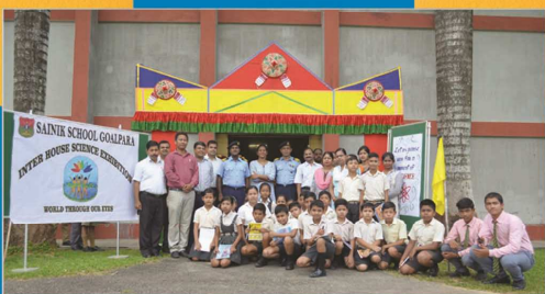
Inter House Science Exhibition