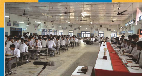
Regimental Lunch in progress