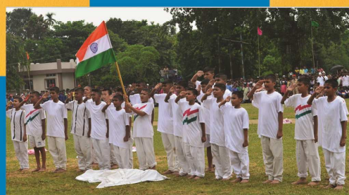
Cultural Performance at Goalpara